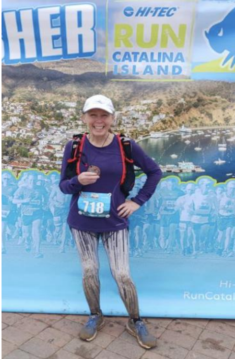
Muddy and Hilly trail marathon on Catalina Island, California