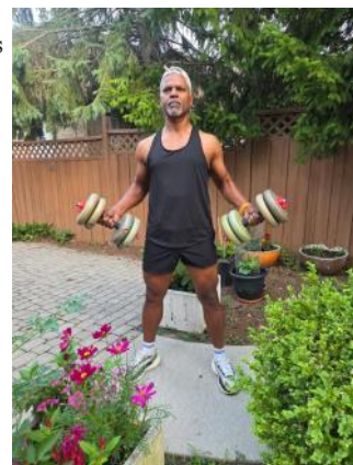
Training in the backyard doing HIIT sessions...

Staying optimistic, I've even signed up for the Spartan Race at Blue Mountain on October 19, 2025. The universe has been warned—I will be ready. Until then, whether walking or running, I look forward to seeing you all at the Don Doan Dash on September 7. Let's keep moving, together.